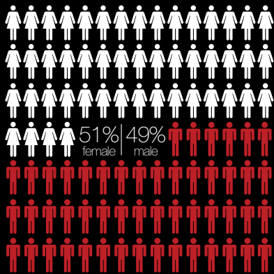
Source: ONS mid-year population estimates

We have a high percentage of people working in these occupations!